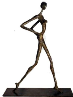
Figure No(2) Italian Gerald Murwood The Walking Man :2014