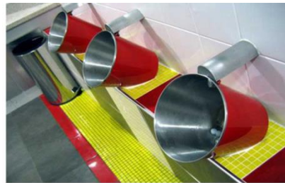
Figure No.(7) American Clark W. Sorenson fire bucket :1988