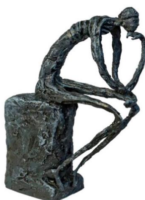
Sample(1-1) French Lionel Le Jeune The Thinker 2021