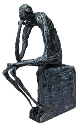
Sample(1) French Lionel Le Jeune The Thinker 2021