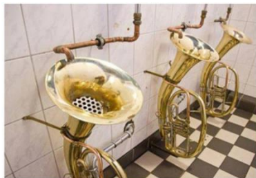
Figure No.(6) American Clark W. Sorenson Trumpet :1988

We observe this type of intertextuality in the works of the American sculptor “Clark W. Sorenson” . See Figure No.(6) Figure No.(7) The intertextuality results in an indirect disguised intertextuality, with the effectiveness of the difference in the code of the message sent to the recipient, to stop at a different reading from the text provided for by the port. In (1917) by the French sculptor “Marcel Duchamp” with his work known as the urinal or the fountain, see Figure No.(8) .