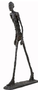
Figure No(3) Swiss Alberto Giacometti walking man :1961

The overlap between the texts of modernity and what follows it with the effectiveness of intertextuality, is characterized by the depth of its intertwined epistemological position, and its insistence on employing the absent culture in its present fabric according to an artistic vision, which confirms that intertextual interactions are available in contemporary sculptural productions, most of which are based on a web of relationships represented by elements Structural formation and the general and specific context of the different methods overlapping with the circle of epistemological knowledge.