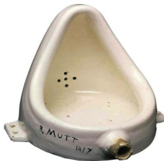
Figure No.(8) French Marcel Duchamp fountain :1917