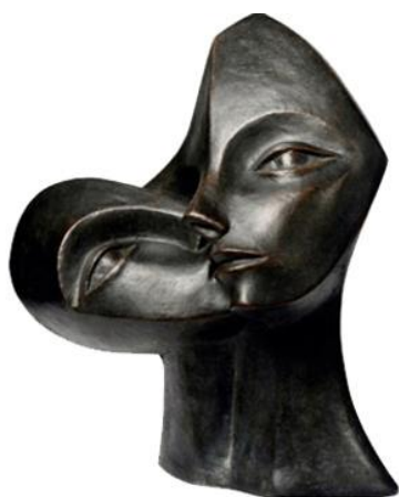
Sample(3) English Beatrice Hoffman upbringing: 2002