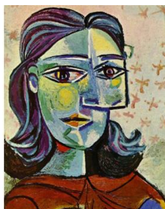
Sample(2-1) Spaniard Pablo Picasso without an address: 1939

Sculptor Hoffman presents in her sculptural text a dialogical intertextuality present as a sample (2) , which is considered a similitude and convergence with another absent artistic text that belongs to the period of modernity, a sample (2-