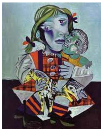
Sample(3-1) Spaniard Pablo Picasso without an address: 1939