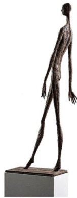
Figure No(1) Italian Gerald Murwood The Walking Man :2014

signs, and signals producing dysfunctional meanings, whether these overlaps are from ancient or previous modern sculptural works. The exclusion of intertextuality from the arts of modernity stops us at the production of the Italian sculptor Gerald Mawroud in his work, The Walking Man , see Figure No.(1) , executed in (2014) , and the Cattle Woman , see Figure No. (2) , executed in (2016) , which relates to the idea and content, as well as the approach of the sculptor's style. The Swiss Alberto Giacometti, interpolated from it, see Figure No. (3) implemented in (1961) .