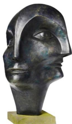
Sample(2) English Beatrice Hoffman tri-headed: 1999